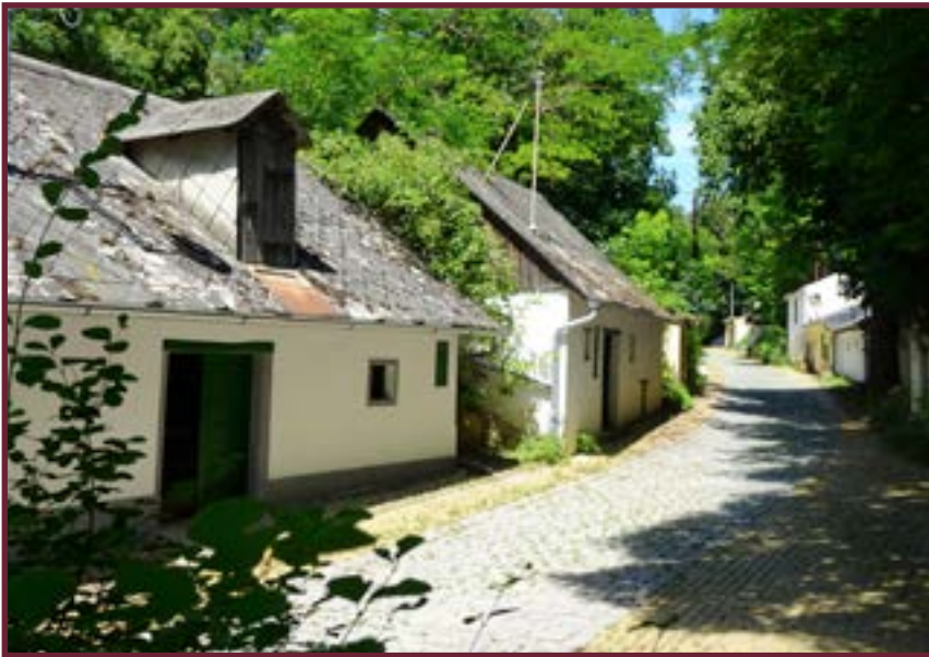
Bockfließ: Kellergasse (wine cellar way). Below it: A more than 200 years old gate to a wine cellar with the owner’s marks and initials.

The small market town Bockfließ is located in the northern part of the Vienna Basin. It has 1 500 inhabitants and belongs to the district of Mistelbach on the Zaya. An “adventure bicycle path” promises to take one along a route of 45 km (30 miles) to a region of white and black gold. “White gold” means here not ebony or porcelain but the white wine made out of the grapes in this region. “Black gold” historically has been the term for profits derived from slave trade. Here, it means oil, petroleum. Quite a surprise, too, to find oil wells