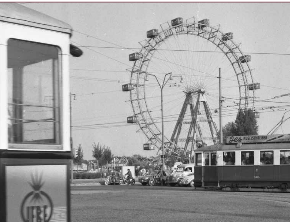
Intersection near Vienna's Prater amusement park , featuring its ferris wheel (»Riesenrad«) and streetcar of the A-line, of the type M-m2/3, in August 1962.

Due to its size, the voters living in Vienna carry quite some weight in national elections. And in local government elections, they cast their ballots for the center-left Social