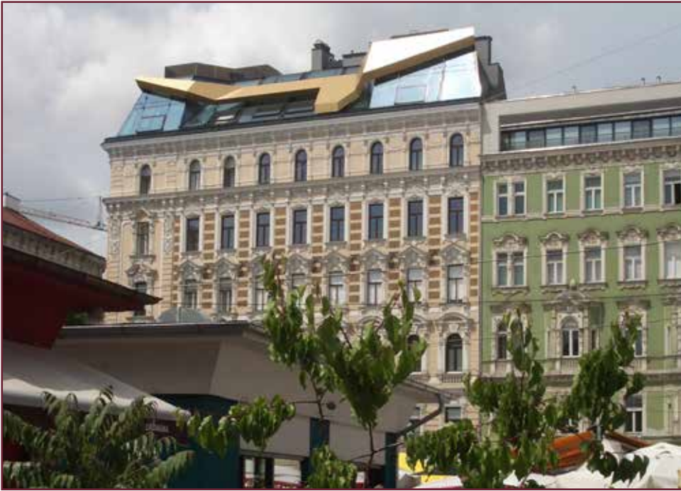
Eyesores – adjacent to Karmeliter-Markt at the former Jewish Quarter: Two different examples of recent addition of top-level stories to increase revenue from apartment rentals – frequently done with little if any consideration for historical façades.

of the building and rented out the remaining space as living quarters or offices.