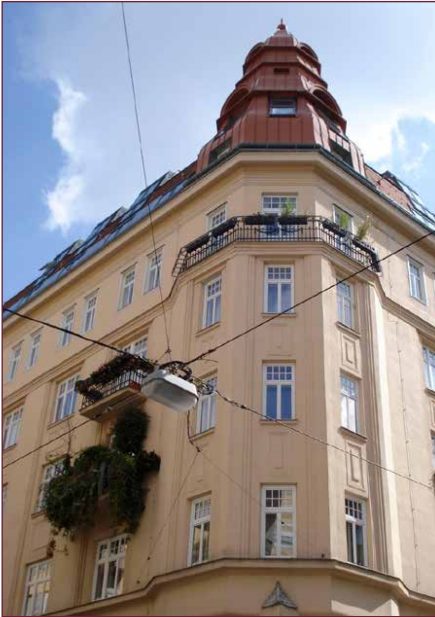
Corner Tower of an apartment building from 1906 refurbished with small windows to accommodate additional apartments in the former attic of the building.

adequate living quarters to the populace. Social building programs started in 1919 with the construction of town houses, followed by large-sized apartment complexes. Red Vienna became famous for e.g. the humongous Karl-Marx-Hof , planned by one of famous architect Otto Wagner's students, Karl Ehn. It provided living quarters for 5000 people. The total length of the complex was over 1 km (0.62 sm), and it established Vienna's reputation in the field of social housing.