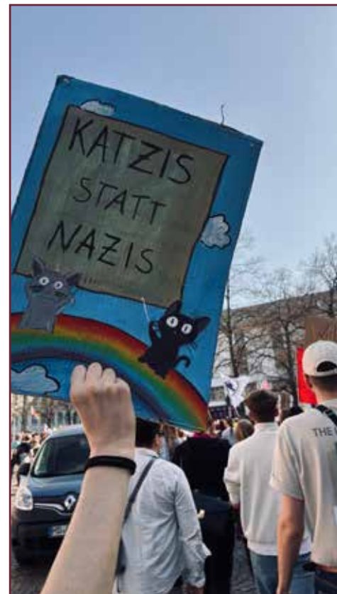
Slogans to Smile about were shown on self-made posters.

Of Heidelberg's 15 districts, the Greens won 13 of them. The supporters of the SPD made long faces. The Social Democratic Party had just passed the 5% hurdle, while Die Linke and the Free Democrats failed to enter the state parliament.