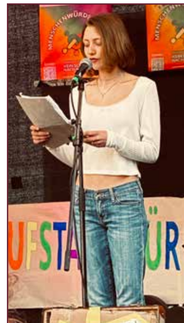
Students against Right-wing Extremists were represented in large numbers at the demo and raised their voice.

One day before the state elections, on Saturday, March 7, 2026, a demonstration against right-wing extremism took place in Heidelberg. This was the third time that the alliance "No Step to the Right Heidelberg" had organized such an event. Now the motto was "Uprising for decency – demonstration for democracy and social cohesion." The voices of the Climate Protest Choir Heidelberg rang out at the Schwanenteichanlage even before the actual rally. In bright sunshine, amplified by a loudspeaker system, it resounded from 13 throats across the square in front of the Heidelberg City Library. As a result, passers-by became attentive, stopped and sometimes even sang along to the well-known melodies, such as the melody of the well-known Christmas carol "Tomorrow,