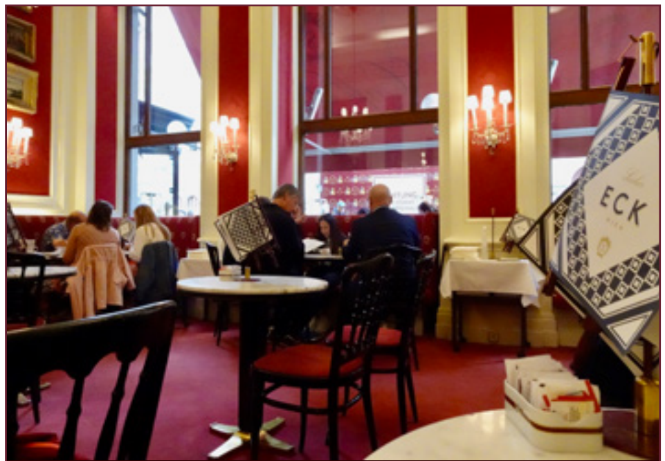
Café Sacher at the world famous eponymous hotel: the embodiment of Vienna coffeehouse culture.