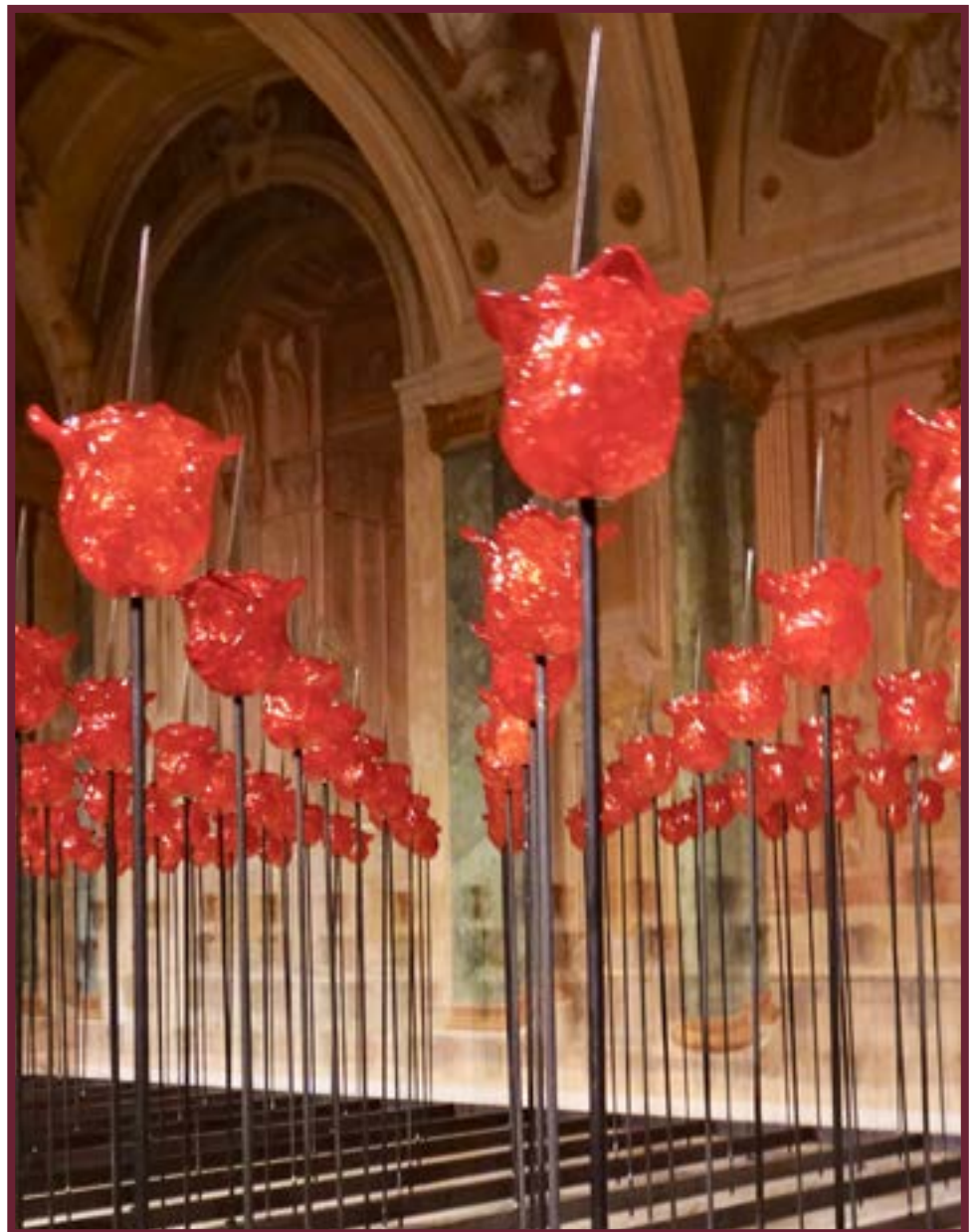
Renate Bertlmann »Murano Glass Roses« Exhibition in the Series Carlone-Contemporary, Carlone Hall, Upper Belvedere, Vienna.

less variety of exhibitions in three different but organizationally related venues, a season ticket for the group of Belvedere museums seemed like a good choice. The additional benefit (which however is at no cost to anyone) is access to the magnificent garden between the Upper and the Lower Belvedere, from the top of which you have a wonderful view of the city of Vienna, already prized by painters in earlier centuries such as the Italian Canaletto.