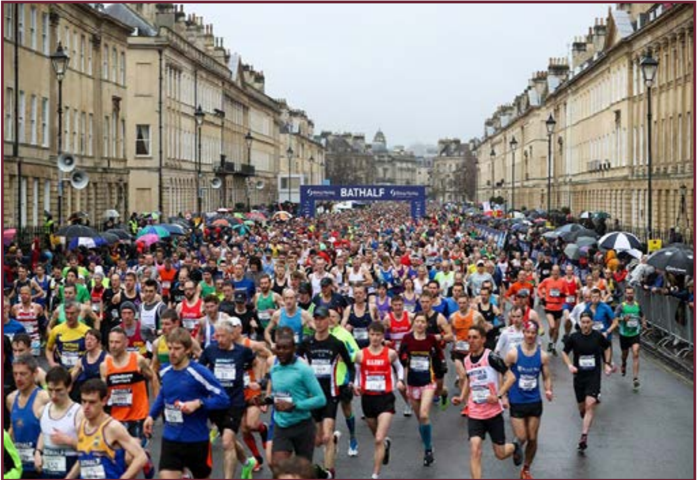
An unforgivable stupidity in England: Despite warnings about corona infection many participants started the race in Bath and spread the virus all over the country.

Rigorous quarantine, »social distancing« (a term that also found entry into the German vocabulary), could still last for weeks, if not months, according to the experts. Only once increase of daily new infections