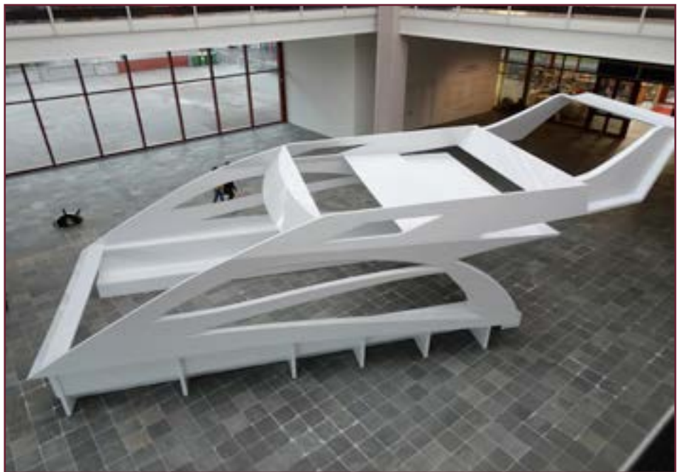
Eva Grubinger »MALADY OF THE INFINITE« Single object exhibition at Belvedere 21 museum in Vienna, 22 November 2019 through 13 April 2020.

The body of a luxury yacht appears to be sinking, surrounded by sea mines, in form eerily similar to corona viruses.